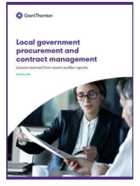
Read the full report here: Local government procurement and contract management: Lessons learned | Grant Thornton